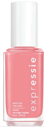
second hand first love