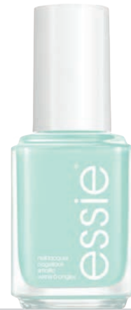
mint candy apple