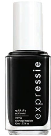
now or never