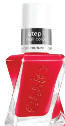
rock the runway