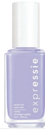
sk8 with destiny