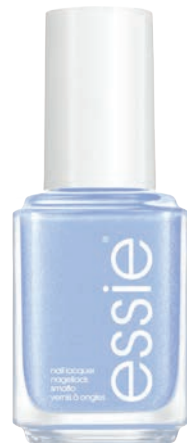
bikini so teeny